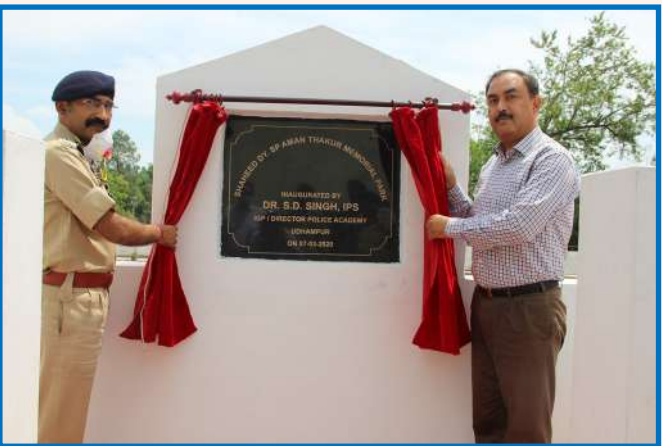
INAUGURATION OF SHAHEED AMAN THAKUR MEMORIAL PARK