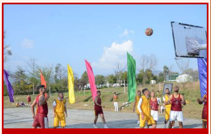
Basket Ball match during Sports Meet