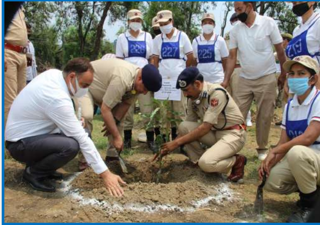
PLANTATION DRIVE ORGANIZED AT SKPA - UDHAMPUR