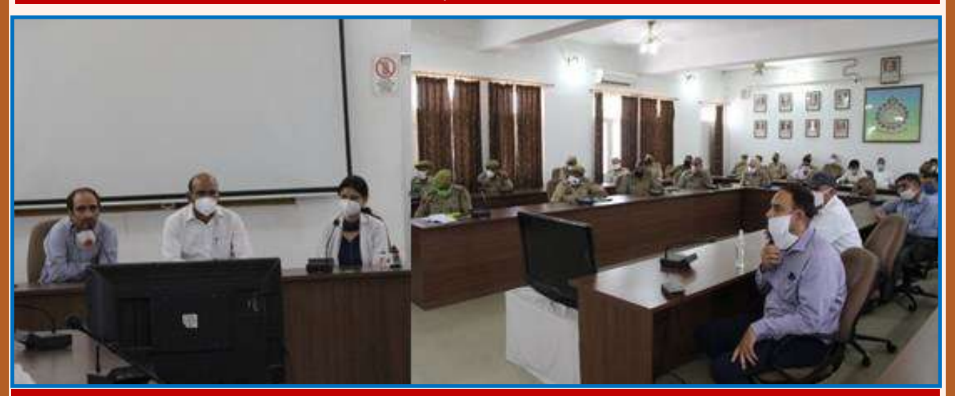
COORDINATION WITH DISTRICT HEALTH AUTHORITIES AT SKPA