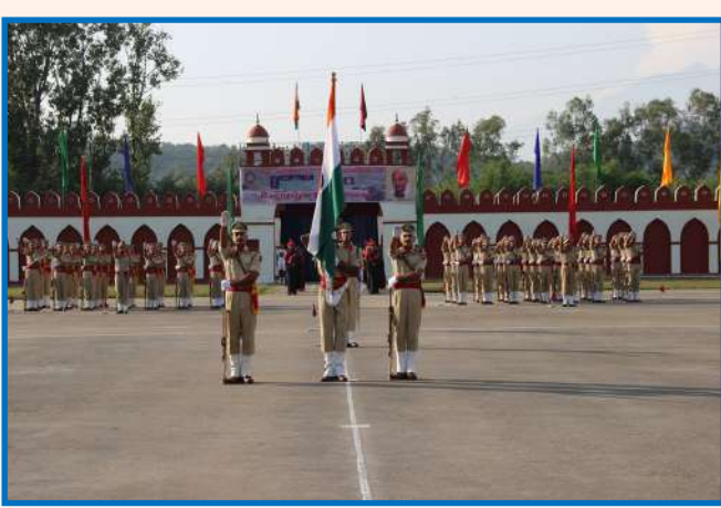
RASHTRIYA EKTA DIWAS CELEBRATED AT SKPAU