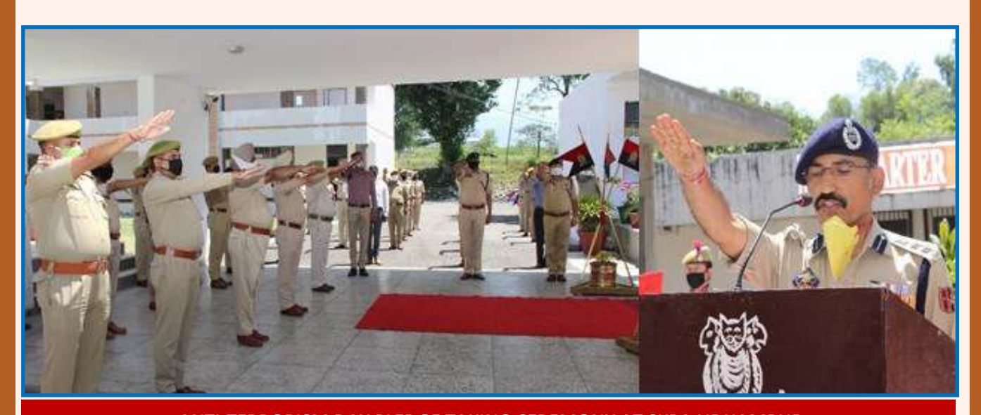
ANTI-TERRORISM DAY PLEDGE TAKING CEREMONY AT SKPA UDHAMPUR