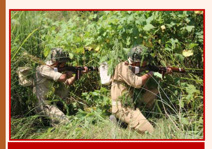
Learning Field Craft Skills