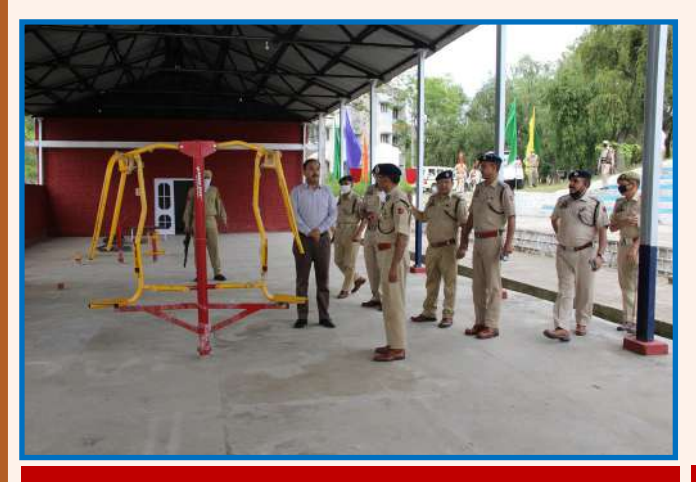
INAUGURATION OF OUTDOOR GYM