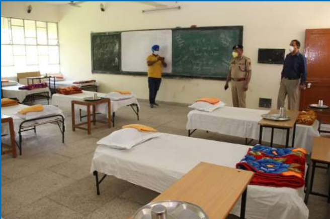
ESTABLISHMENT OF QUARANTINE CENTER AT SKPA