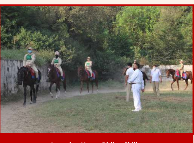
Learning Horse Riding Skills