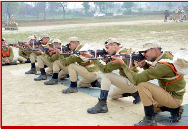
Trainees during Range Classification