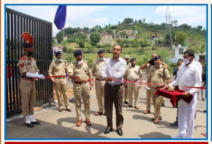
INAUGURATION OF NEW MAIN GATE