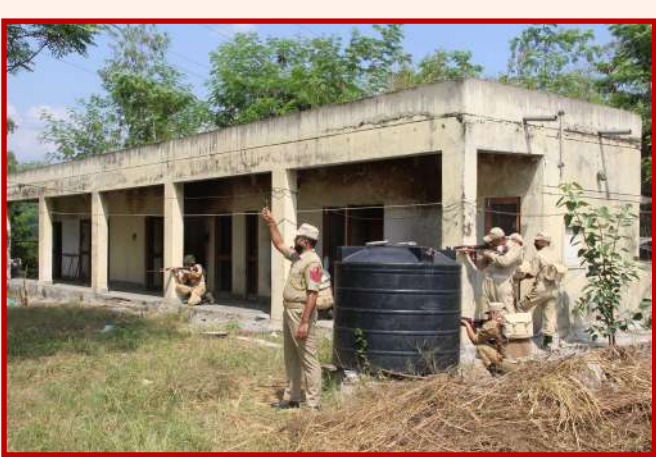
Learning Room Intervention Skills