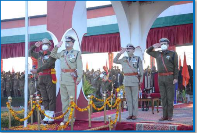
CELEBRATION OF REPUBLIC DAY AT SKPA UDHAMPUR