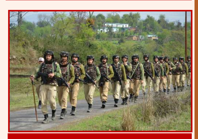
Trainees on Route March